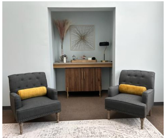
Insight's new offices in Cheatham County (left) and Cookeville, Tennessee